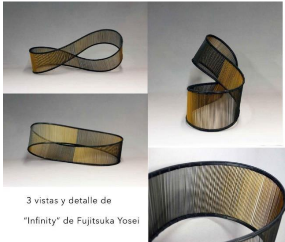
3 vistas y detalle de "Infinity" de Fujitsuka Yosei

By the same artist. Here, for example, a top view of the work should be convenient.